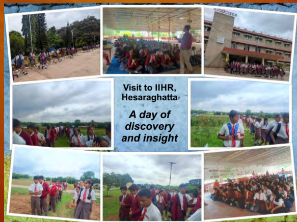
Visit to IIHR, Hesaraghatta A day of discovery and insight

Grade 7 students embarked on an educational trip to SRK Temple of Oils Pvt. Ltd, Bengaluru, where they gained valuable insights into the process of edible oil extraction through hands-on observation and learning.