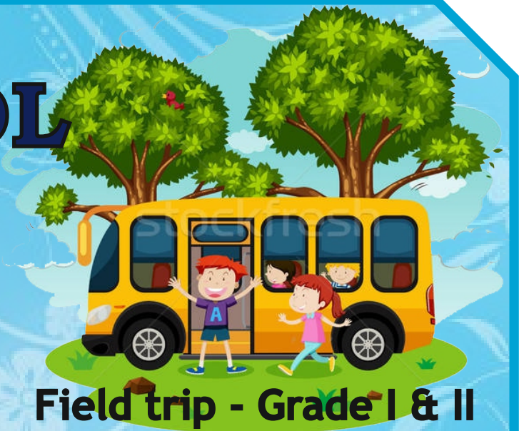
Field trip - Grade I & II

“Just education is not enough, children must have sunshine, freedom and playtime”